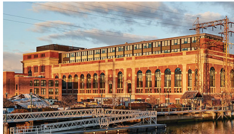
South Street Landing, Brown University

OUR 14 UNIVERSITY RELATIONSHIPS (<1% OF UNIVERSITIES NATIONWIDE) FUEL 10% OF ALL R&D SPENDING IN THE U.S.