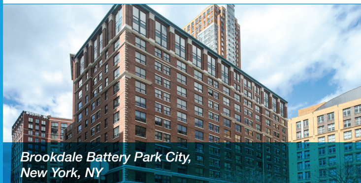
Brookdale Battery Park City, New York, NY

Representing just over half of the Company's net operating income (NOI), Ventas's 727 seniors housing communities provide compelling residential environments for seniors with caring assistance and support for their daily needs. These communities generate resilient private pay revenues and provide high-quality consumer-driven choice for seniors.