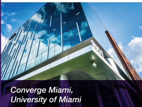
Converge Miami, University of Miami