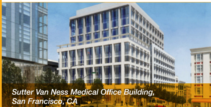
Sutter Van Ness Medical Office Building, San Francisco, CA

The Ventas Medical Office/Outpatient Building (MOB) portfolio generates reliable growing cash flows and has expanded more than seven times since its inception in 2010. Generally affiliated with or on the campus of market leading hospitals, Ventas's 20+ million square foot MOB portfolio expands across 360 properties in 32 states.