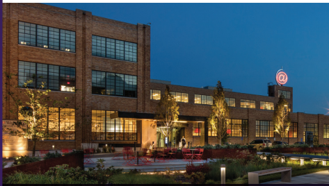
Cortex Innovation Community, Washington University in St. Louis

OUR 14 UNIVERSITY RELATIONSHIPS (<1% OF UNIVERSITIES NATIONWIDE) FUEL 10% OF ALL R&D SPENDING IN THE U.S.