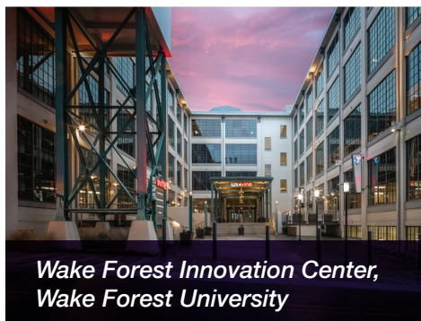
Wake Forest Innovation Center, Wake Forest University