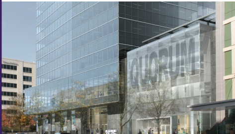
uCity Square, University of Pennsylvania, Drexel University

As the leading developer of university-based Research & Innovation (R&I) knowledge communities, Ventas and its exclusive development partner Wexford Science & Technology are actively expanding our R&I portfolio with the nation's leading research institutions. A priority in the Company's current capital allocation, Ventas has grown the business by nearly 50 percent since its inception in 2016. The partnership has created a $1.5 billion near-term development pipeline comprised of 10+ projects with existing and new university relationships.