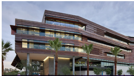
Phoenix Biomedical Center, Arizona State University